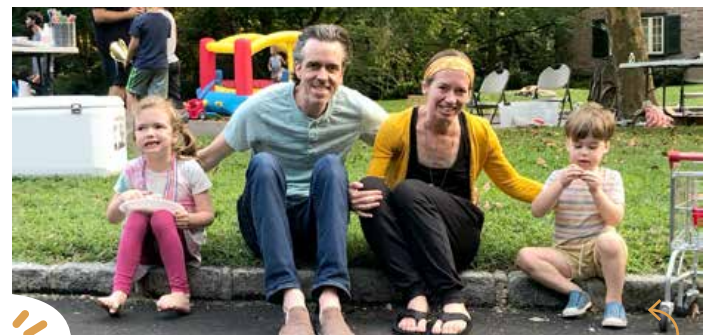
FAMILY FUN AT OUR ANNUAL BLOCK PARTY