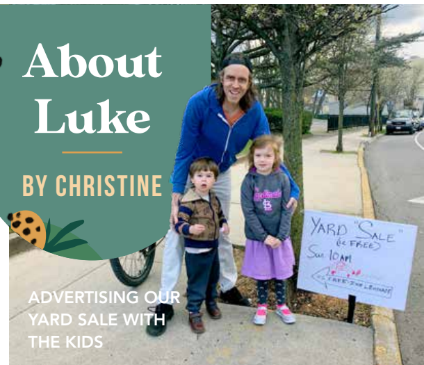
ADVERTISING OUR YARD SALE WITH THE KIDS