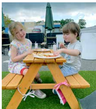
CARROTS AND CRACKERS ON A ROADTRIP STOP