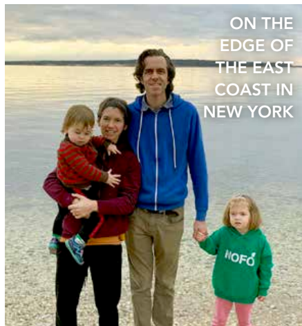
ON THE EDGE OF THE EAST COAST IN NEW YORK

WE ARE TRYING TO RAISE CHILDREN WHO RETAIN THE BEST PARTS OF CHILDHOOD AS THEY GROW: WONDER, CURIOSITY, SILLINESS, AND EASY LAUGHTER. Daily, we attempt to cultivate empathy in our children, for each other and us, but also for the new friends they make and the strangers they meet. We want our children to be self-confident and grounded, to trust themselves. We hope that as they grow into adulthood, they try to do good in the world they encounter.