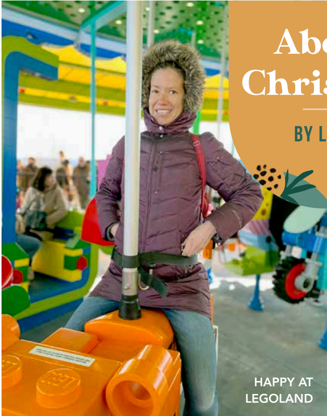
HAPPY AT LEGOLAND

Favorite place to take our kids: WOODS OR BEACH I have a massive PEZ COLLECTION!