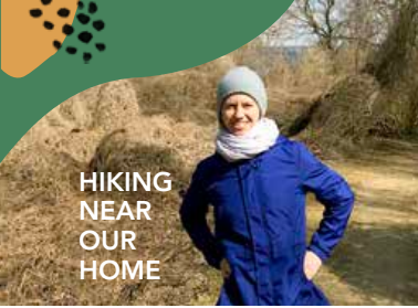
HIKING NEAR OUR HOME