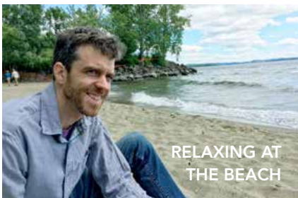
RELAXING AT THE BEACH