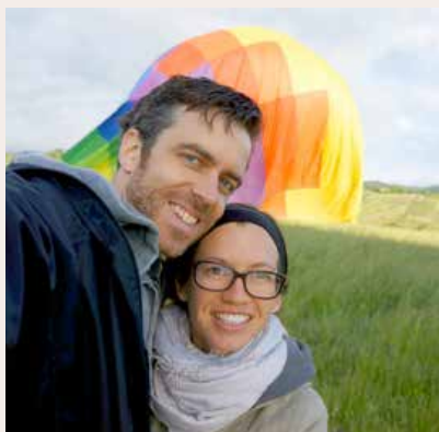
HOT AIR BALLOON RIDE!

THANK YOU FOR TAKING THE TIME TO GET TO KNOW US.